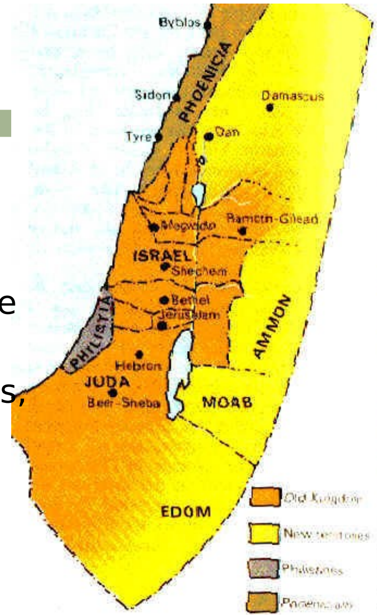
Israel/Canaan during the reign of King David