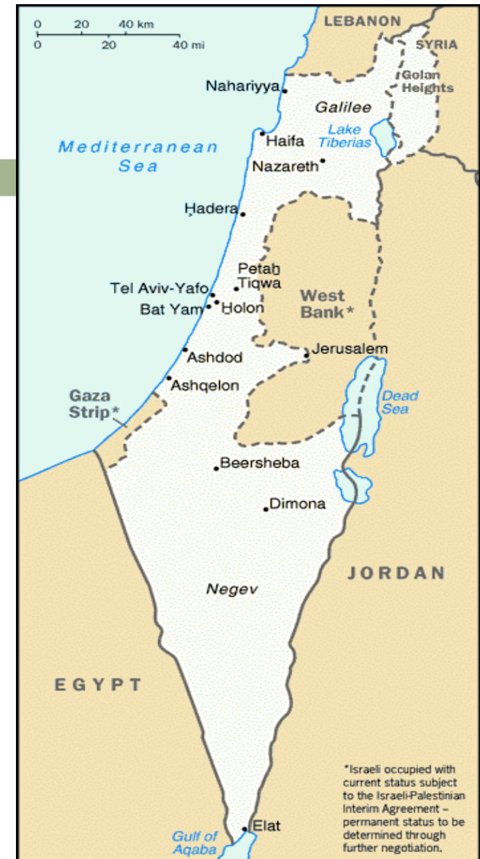
Israel/Canaan during the reign of King David